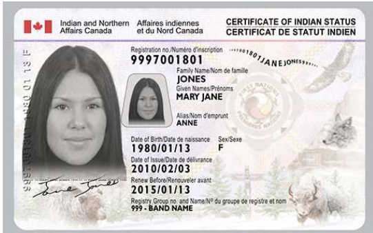
Example of registration card

When obtaining services for a registered or Treaty/First Nations' child, give the service provider the child's registration number and advise the service provider to bill Health Canada.